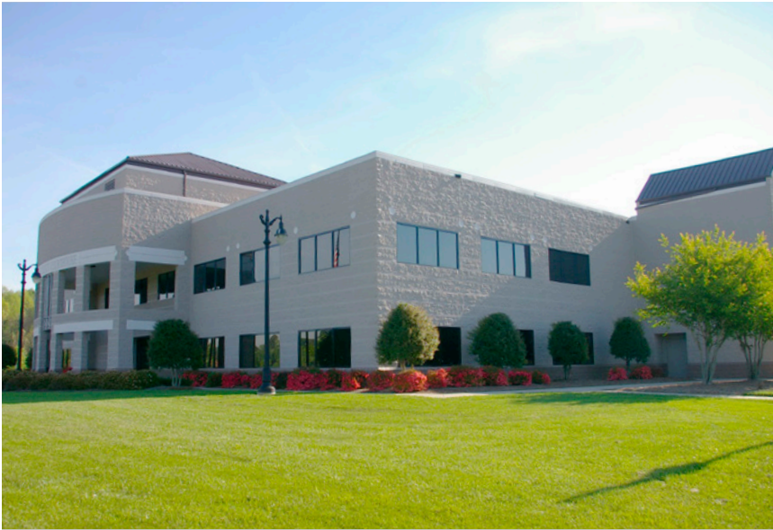
Wilkes County Courthouse worked with Daikin's Service Team to evaluate cost savings and efficiency of a 20-year old chiller versus new air-cooled chiller.