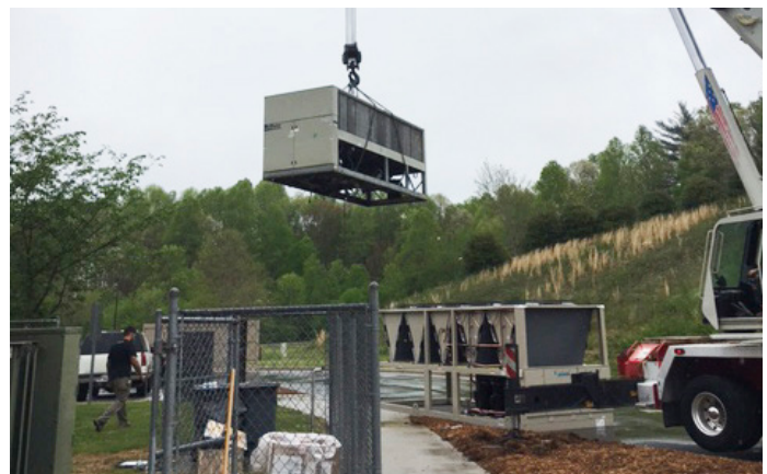
The existing chiller is removed to make way for a new Daikin Trailblazer air-cooled chiller that could save $48,000 in energy costs over seven years.